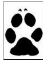
Coyote print more oval