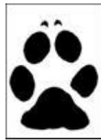
Dog print round

Urban Coyote Ecology and Management Cook County, IL