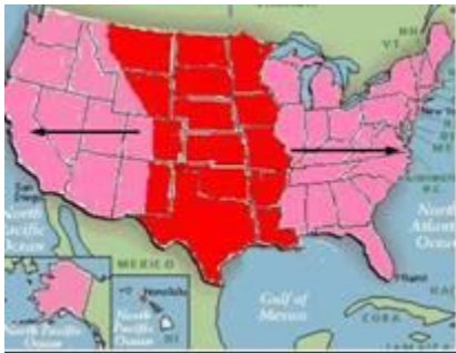
Coyote dispersal range

Coyotes are originally native to California and several other western states. Due to their intelligence, adaptability, and the decline of larger animals, coyotes have successfully expanded their range. They are now found in all states except Hawaii and have successfully established themselves in every urban ecosystem across North America.